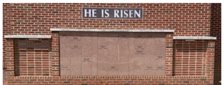
Initial columbarium and memorials (located under the cross as seen in the sanctuary and from the road)

Second columbarium with 64 niches. The backside of this wall faces the road and is directly across from the initial columbarium