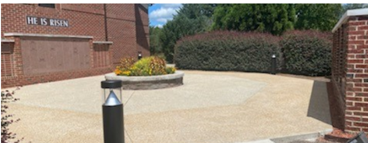
Entrance to Columbarium courtyard (with your back towards the parking lot) Initial columbarium on the left, second columbarium on the right.