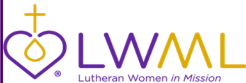
LWML Annual Ladies Christmas Luncheon

at Church or at Eagleprod@mindspring.com OR call 919-553-3579